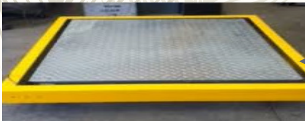
Platform scale barrier