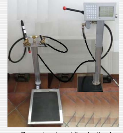
Remote stand for indicator